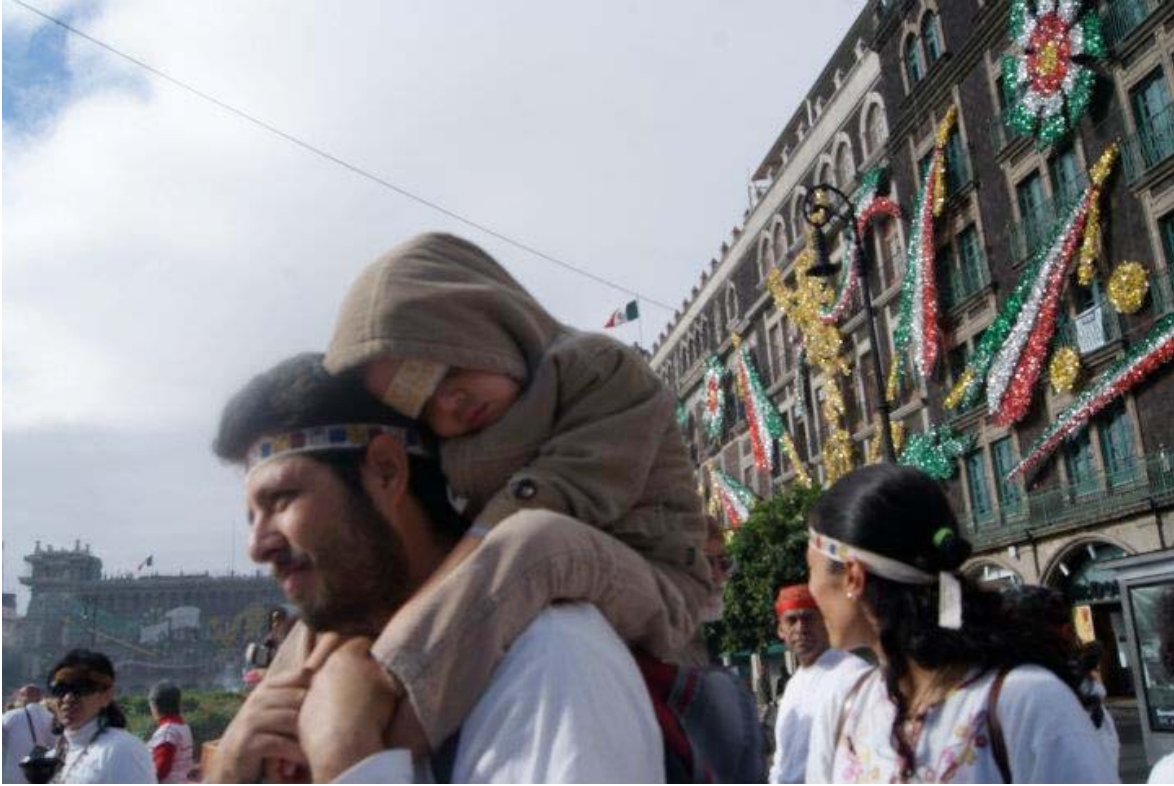
Oxlahun Ben y Ox Muluc